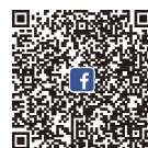
Follow us on Facebook