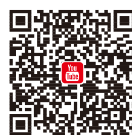
Follow us on YouTube