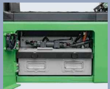
Lithium battery pack