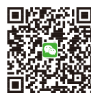
Follow us on WeChat