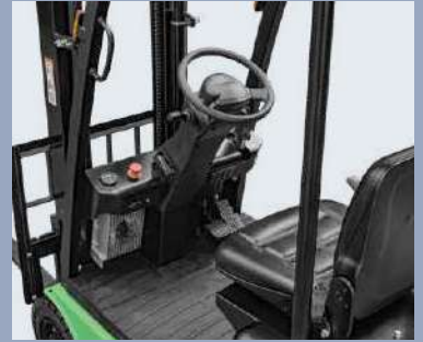
Large and comfortable operation space