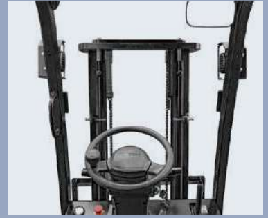
Wide view mast